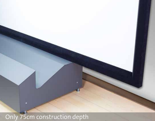
Only 75cm construction depth