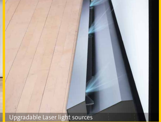
Upgradable Laser light sources