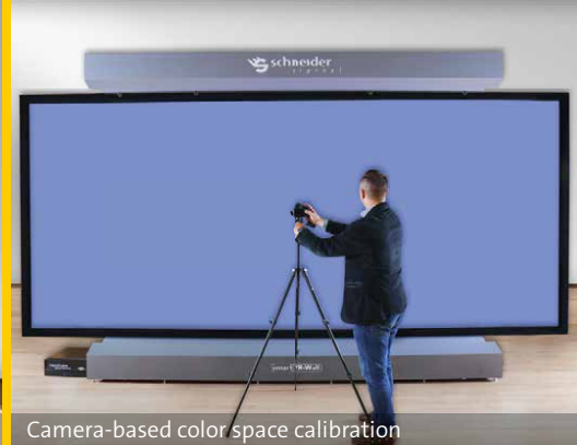
Camera-based color space calibration