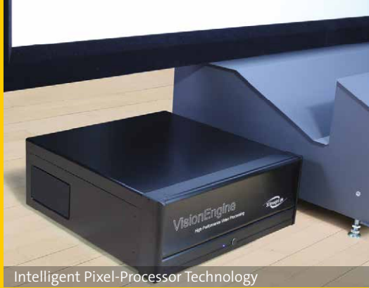
Intelligent Pixel-Processor Technology