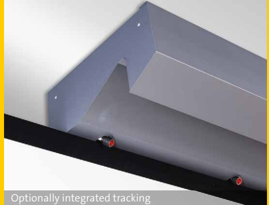
Optionally integrated tracking